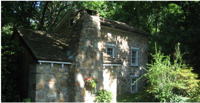
7. Malmgren House 42 Wellesley Circle