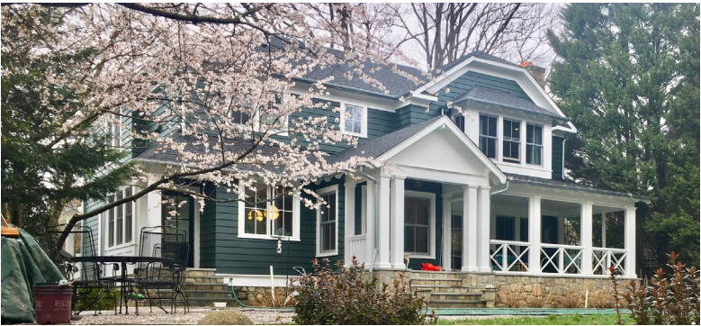
8. McFarland House 1 Vassar Circle