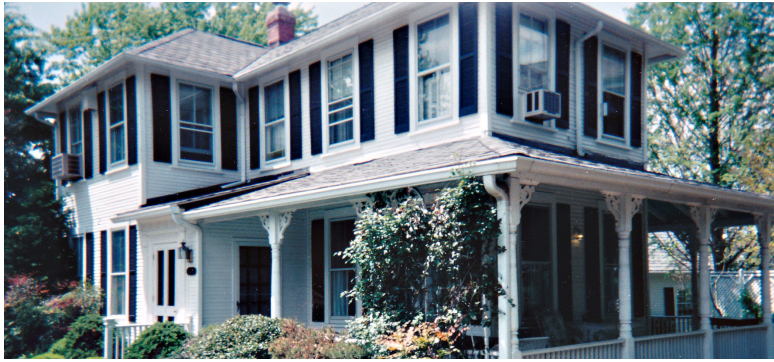
1. Stevenson House 6106 Yale Ave