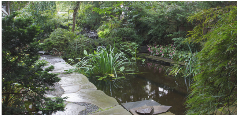
4. Shimizu Garden 6101 Bryn Mawr Ave

The Daen house was built in 1903, and a large family room and a two-story addition were added in the 1970s. The kitchen was remodeled in the 1990s and has oak cabinets and a large picture window. Skylights infuse the family room and kitchen with light. The living room/dining room has a lovely stone double-sided fireplace, and a sunroom was added in 2013 to take advantage of the view of the river and canal. Contrasting trim and other Victorian details and a deck overlooking parkland add to the charm of this century-old house.