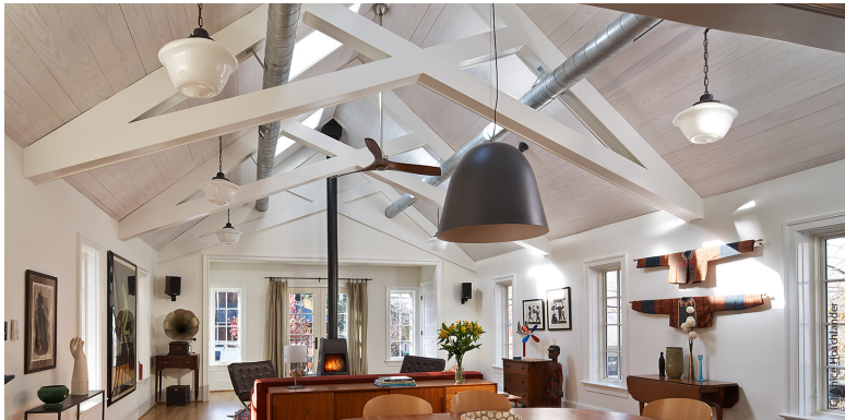
2. Hirsch House 7317 University Ave